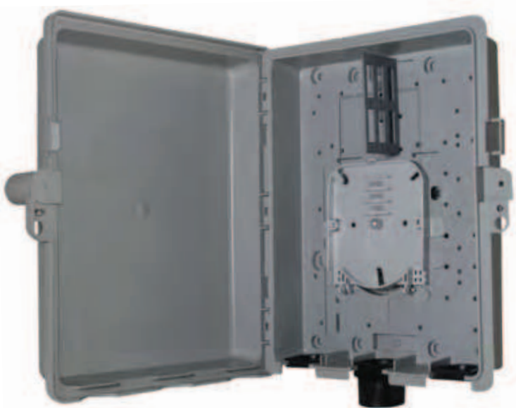
P136Fiber Enclosure with FS3.