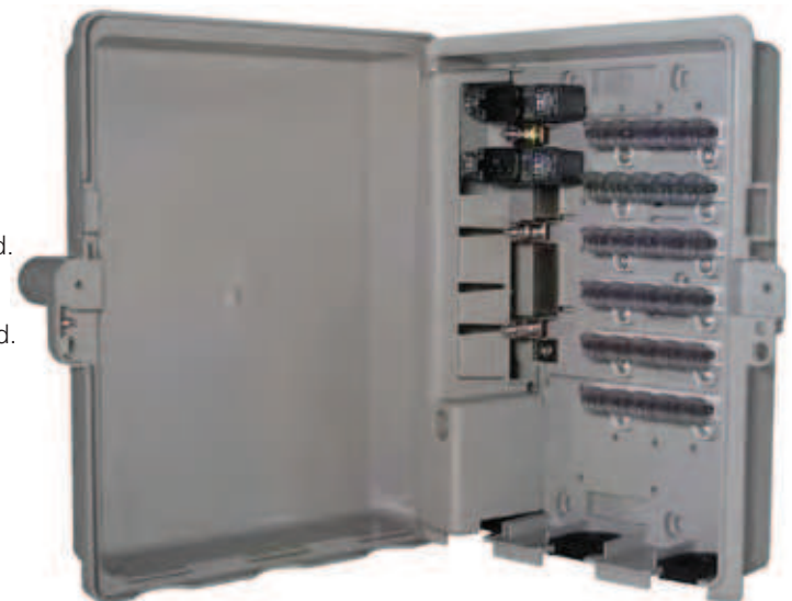
P136 Network Interface Device.